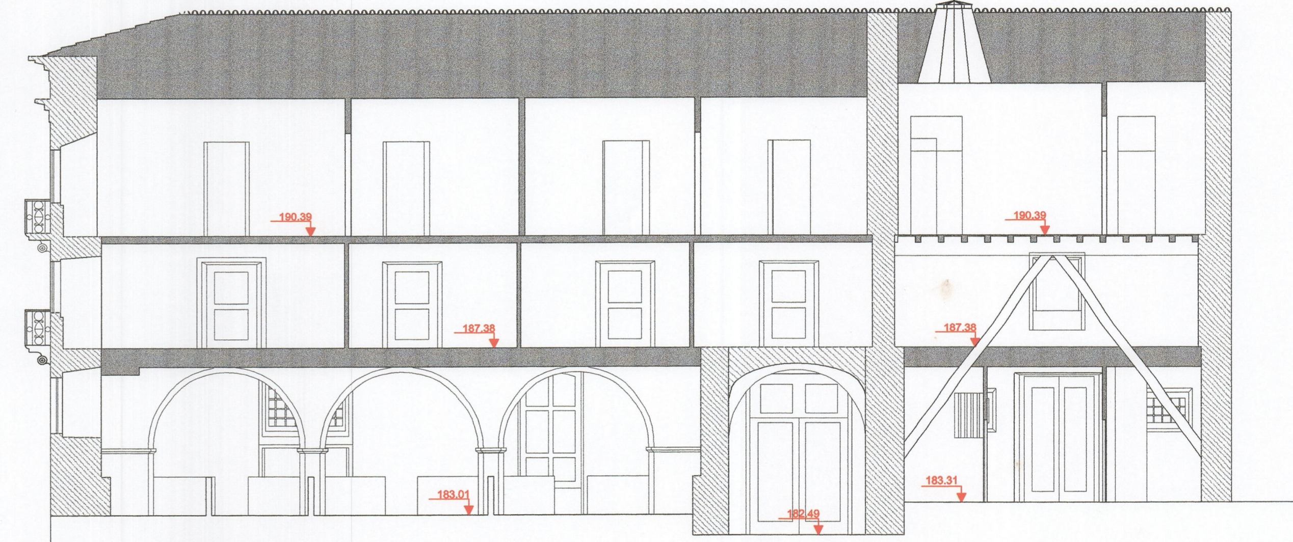
CORTE I' - J