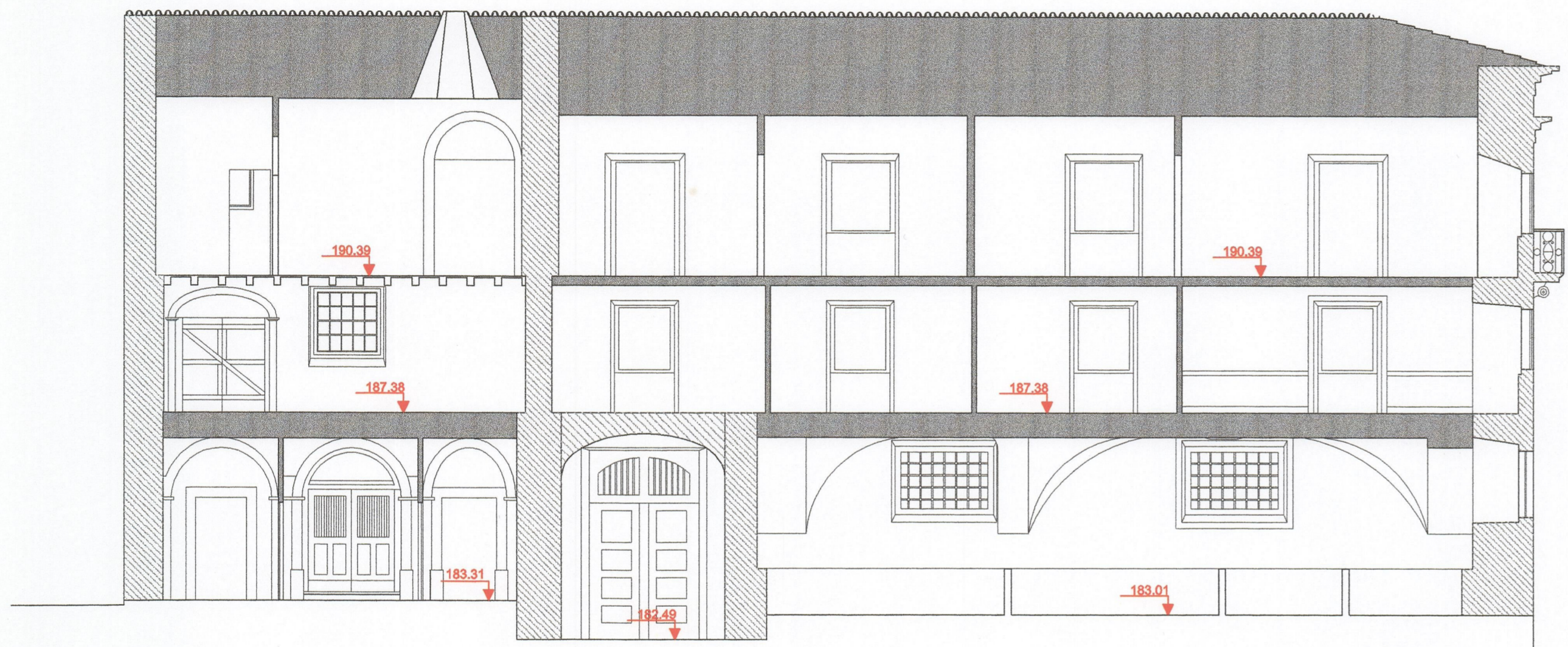
CORTE I - J