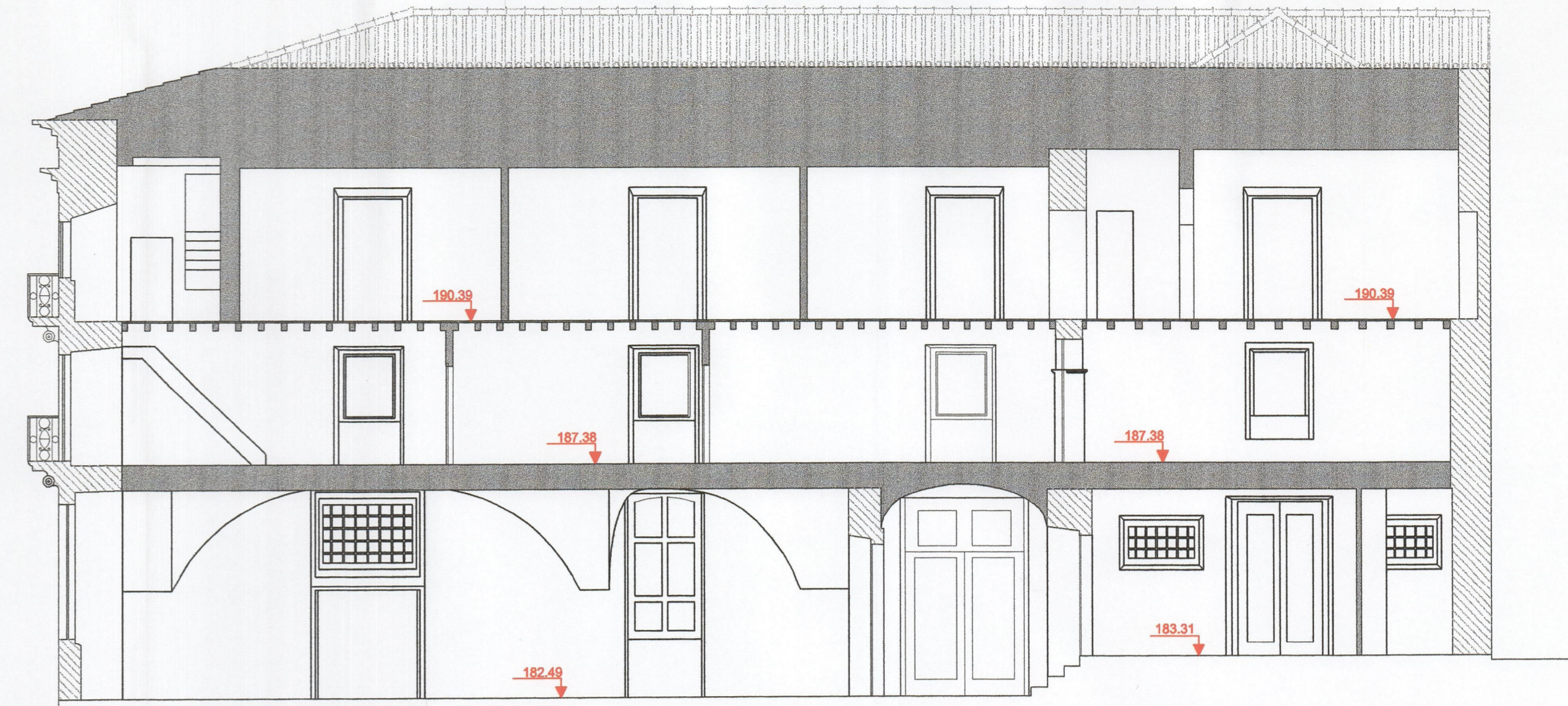
CORTE G' - H