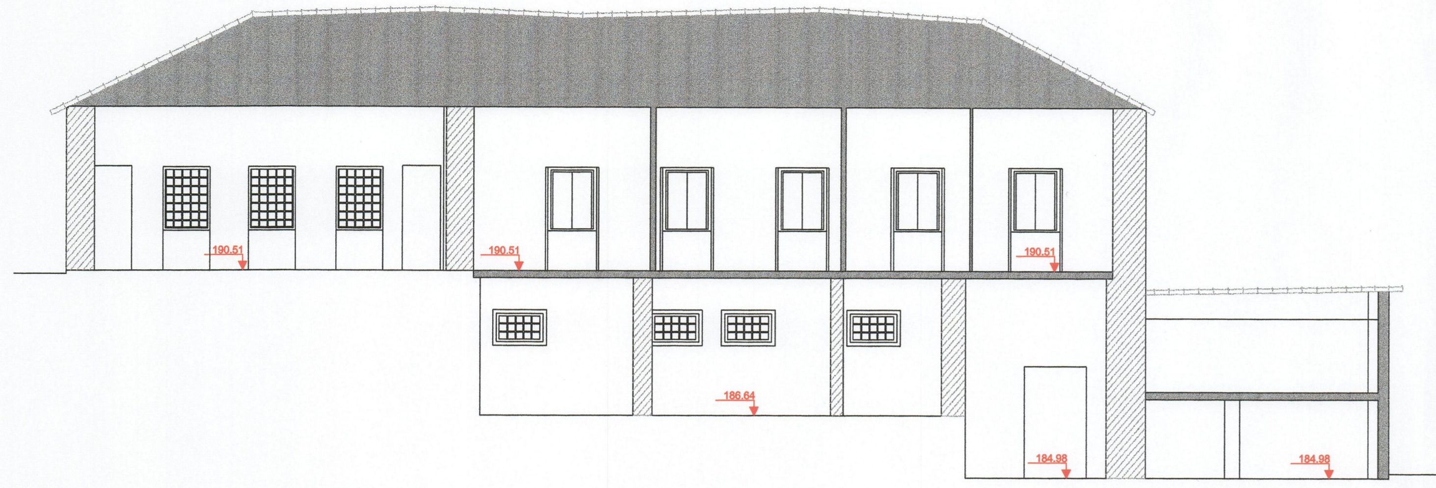
CORTE 1 - 1