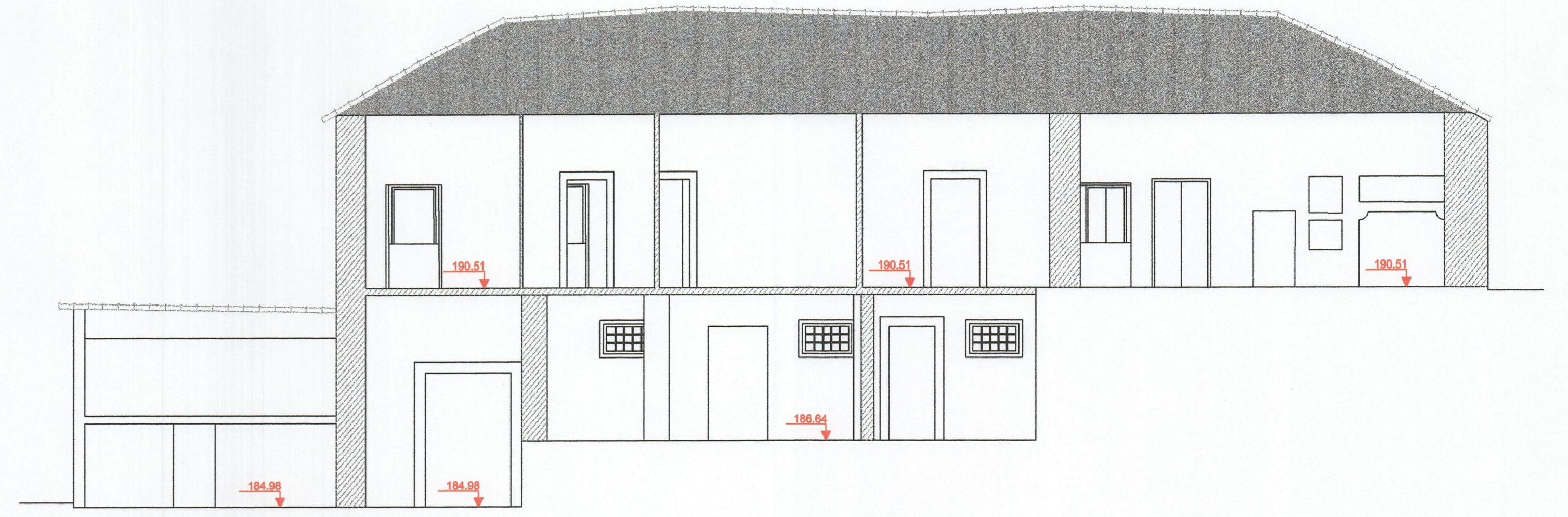
CORTE 1V - 1V